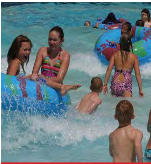
DESERT WAVE POOL