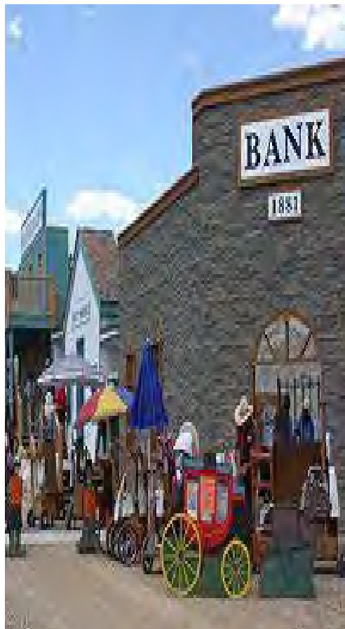
NORTH SPRINGS SHOOTING RANGE