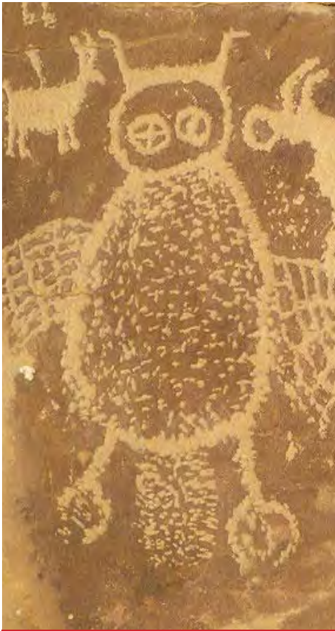
NINE MILE CANYON