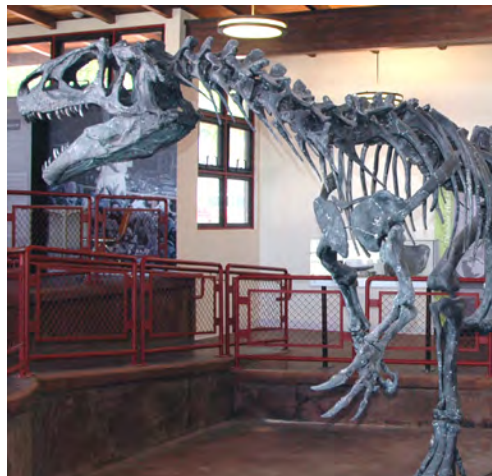
CLEVELAND LLOYD DINOSAUR QUARRY